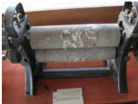
Bees wax press