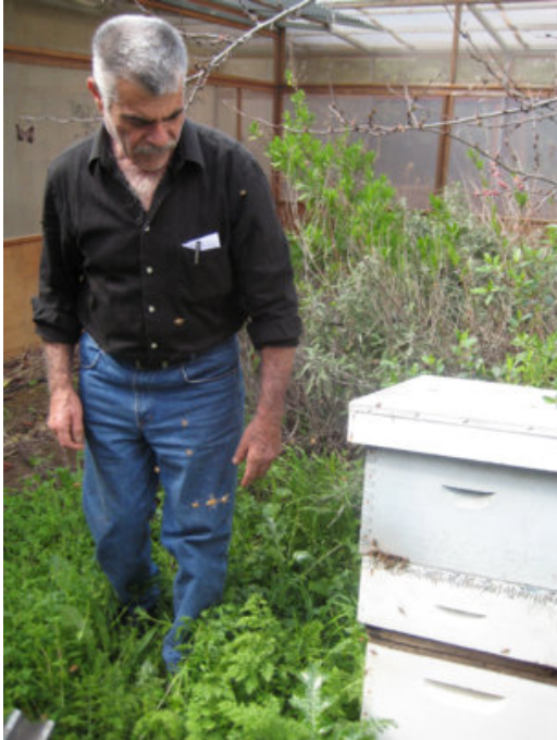
Ahuvia 2008 looks at working Hive in Yfat

From the bee museum in YFAT where active hives are part of the exhibit.