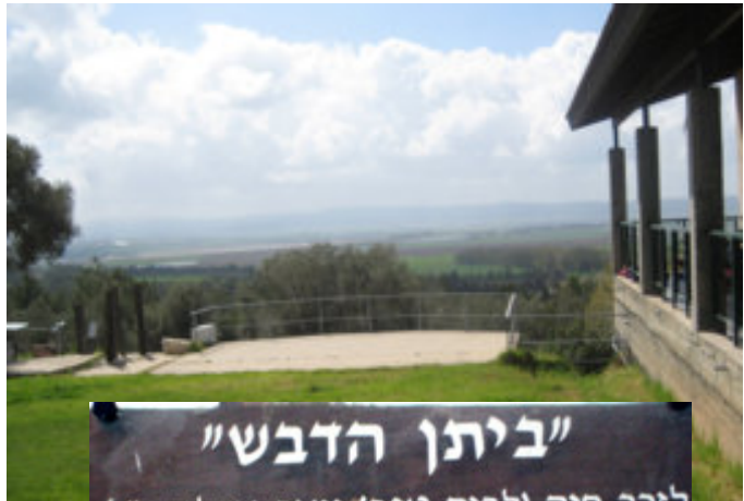
Kibbutz Yfat overlooks the Emek